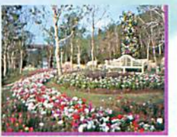
Promenade Garden magnificent views of flowers, ocean and blue sky

Each number on the map is equivalent to the sign on the information board.